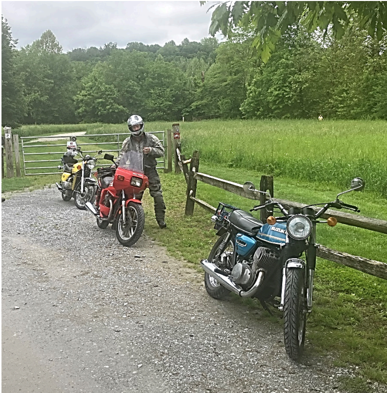
LEFT, DAY ONE: One stop along Local Loops is the sprawling ChesLin preserve.